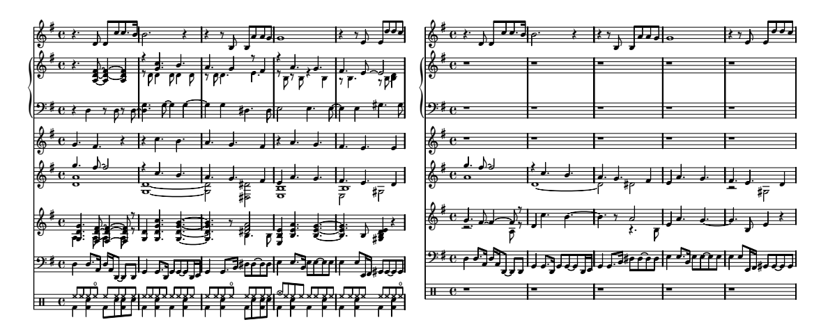
Fig. 2. Five measures of an ABBA song, the original on the left and the summary on the right.

Figure 2 shows on the left five bars from one of the ground truth files (k000589) in the Karaoke dataset (transcribed by the authors). On the right the same passage is depicted after applying the skylining and reduction using the settings from our fourth experiment. The top staff containing the usually sung melody is kept intact. The second voice (next two staffs) holds a piano accompaniment that was completely omitted, probably due to the fact that it was rhythmically uninteresting as there is an onset on every eighth note. The highly active bass line (second last staff) was kept, and the very repetitive drum track was removed.